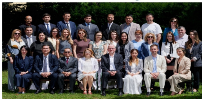
Debt Management Performance Assessment (DeMPA) Workshop Vienna, Austria from July 14-18, 2025

THE WORLD BANK IBRD • IDA | WORLD BANK GROUP